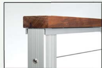
Aluminum Channel for Wood Cap Rail