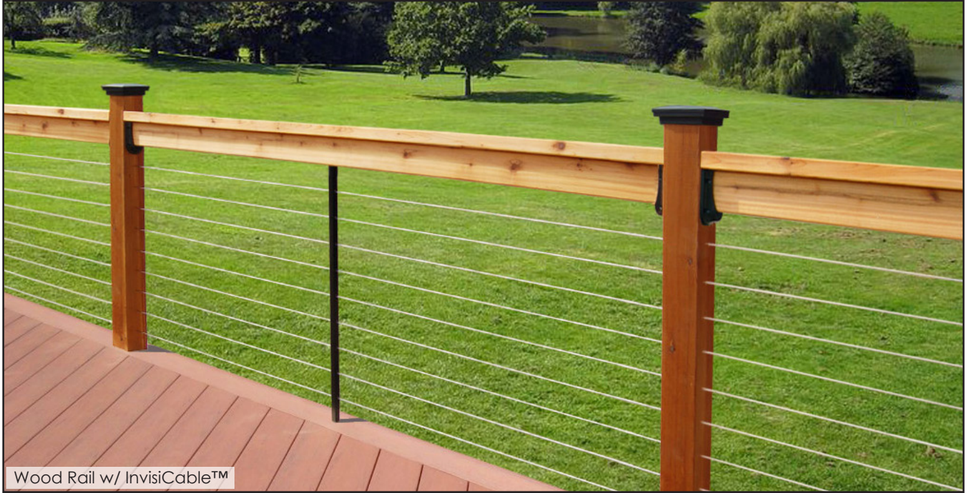
Wood Rail w/ InvisiCable TM