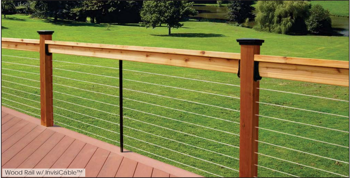
Wood Rail w/ InvisiCable TM