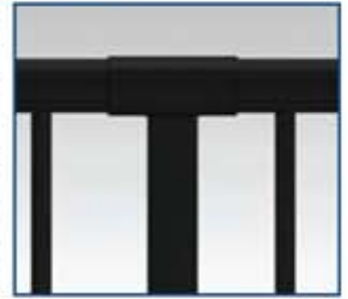
OVER THE POST