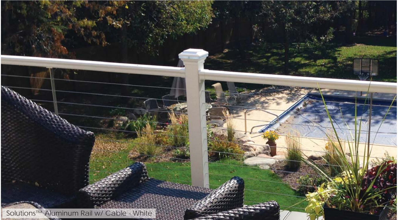
Solutions TM Aluminum Rail w/ Cable - White