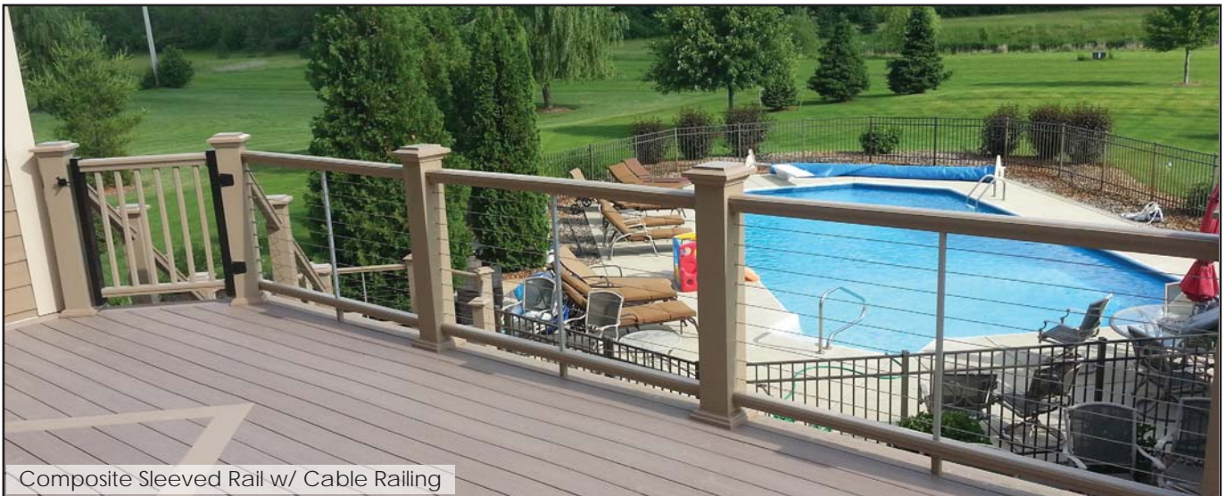
Composite Sleeved Rail w/ Cable Railing