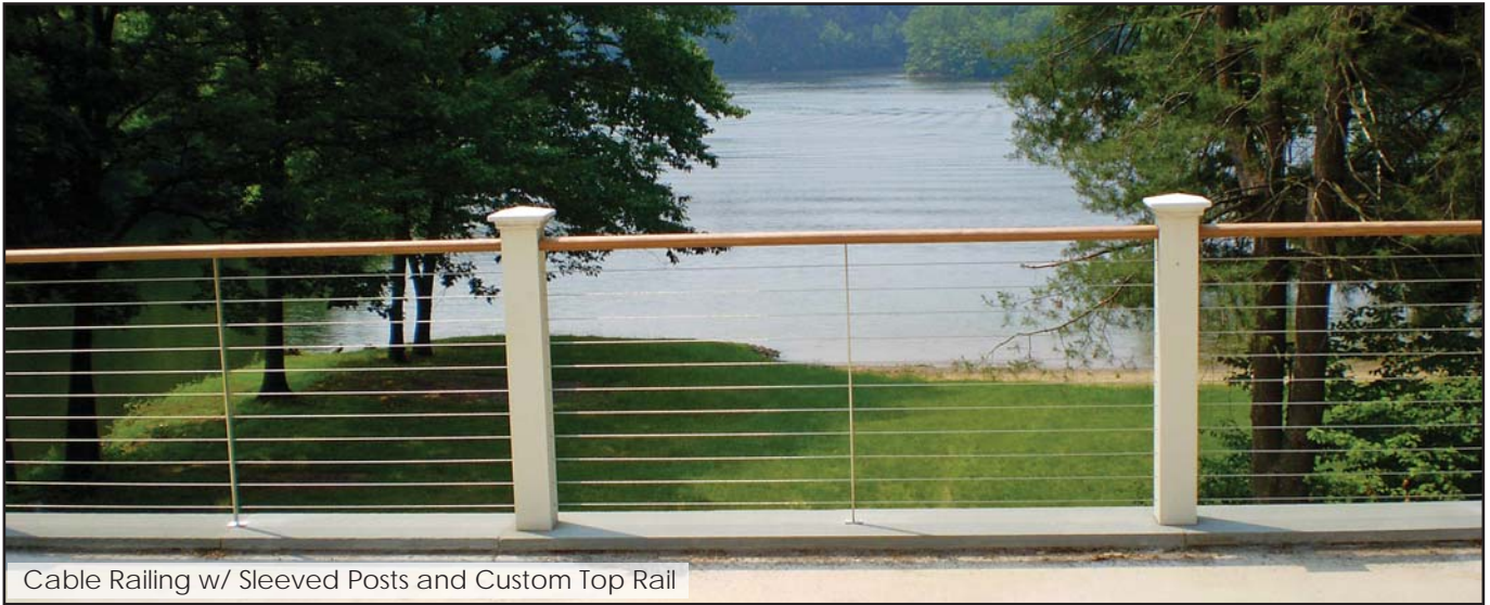
Cable Railing w/ Sleeved Posts and Custom Top Rail

ACTUAL FREIGHT CHARGES APPLY TO ALL SOLUTIONS TM RAIL ORDERS