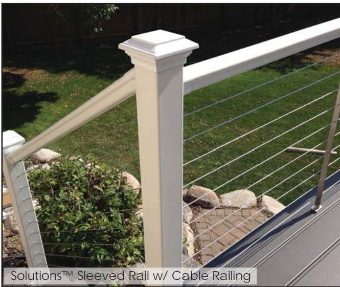
Solutions TM Sleeved Rail w/ Cable Railing