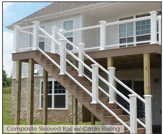
Composite Sleeved Rail w/ Cable Railing